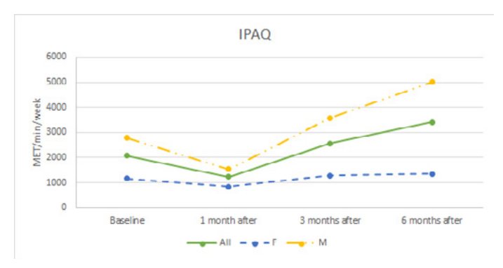
Figure 1: IPAQ median score at baseline and after the camp, in whole sample and by gender.

26 participants (12 females, 41.3 \pm 11.0 years) completed the study. The median of BMI was 23.7 kg/m2 (IQR=22-25.6) and the median age of diabetes onset was 20 (IQR=10-28). 27% (n=7) did not exercise at all. The median of PA level before the camp was 1588 MET-min/week (IQR=990-3276) meaning that sample was largely composed by moderate active subjects. In the first month after the camp PA showed a decrease, instead at third and sixth month an increase was observed (p>0.05). Furthermore, females showed lower PA level at baseline (p=0.022) and at 6 months (p=0.045) (Figure 1).