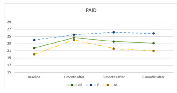
Figure 3: PAID median score at baseline and after the camp, in whole sample and by gender.

Except for the first month, PAID score slightly increased and females showed higher score compared to males (p>0.05) (Figure 3).